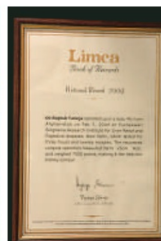
WORLD LARGEST KIDNEY TUMOR ANGIOMYOLIPOMA