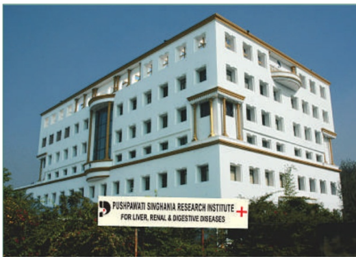
Hallmark of Medical Excellence